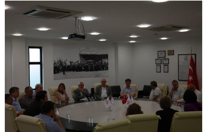
At the Karacabey Chamber of Commerce