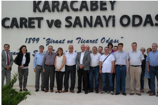
At the Karacabey Chamber of Commerce

The latest AEDIL Board Meeting & General Assembly was held from 3 rd – 5 th June 2015 in Bursa, Turkey