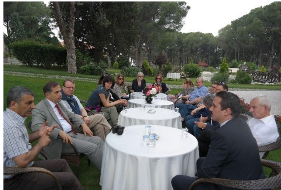
At the Tigem Karacabey Government Farm